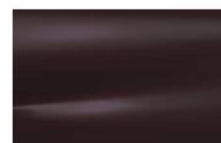
From the UNISON color palette